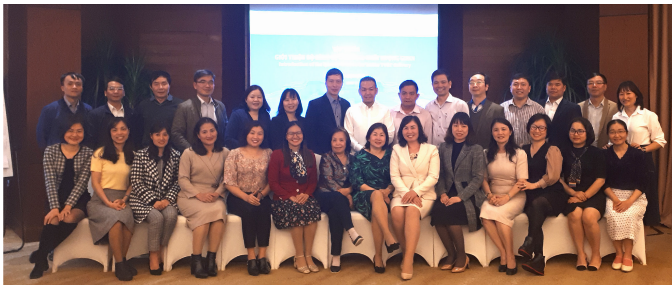
Training of core trainers on the use of GIZ's "Quality toolbox for better TVET delivery".