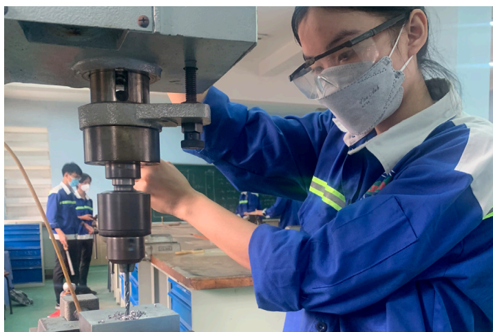
PAM's student in the practical lesson at LILAMA2 International Technology College.

The Programme “ Migration & Diaspora (PMD) / Field of action Regular Labour Migration and Mobility ” (ReM) aims at improving The qualification and mobility scheme piloted within the framework of PAM