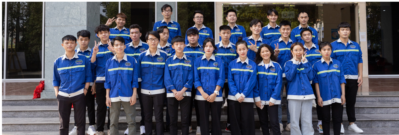
Opening ceremony of metal cutting training course within the framework of PAM.

information on regular and safe migration pathways for potential migrants in selected partner countries. Its country component in Viet Nam is implemented in partnership with the MoLISA and in close cooperation with the Department of Overseas Labour (DoLAB), Department of Labour, War Invalids and Social Affairs (DoLISA), Migrant Resource Centers, Employment Service Centers, and the Institute of Labour Science and Social Affairs (ILSSA).