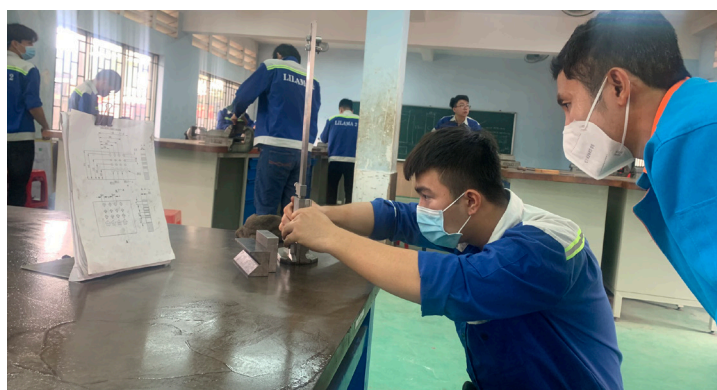
PAM's student in the practical lesson at LILAMA2 International Technology College.